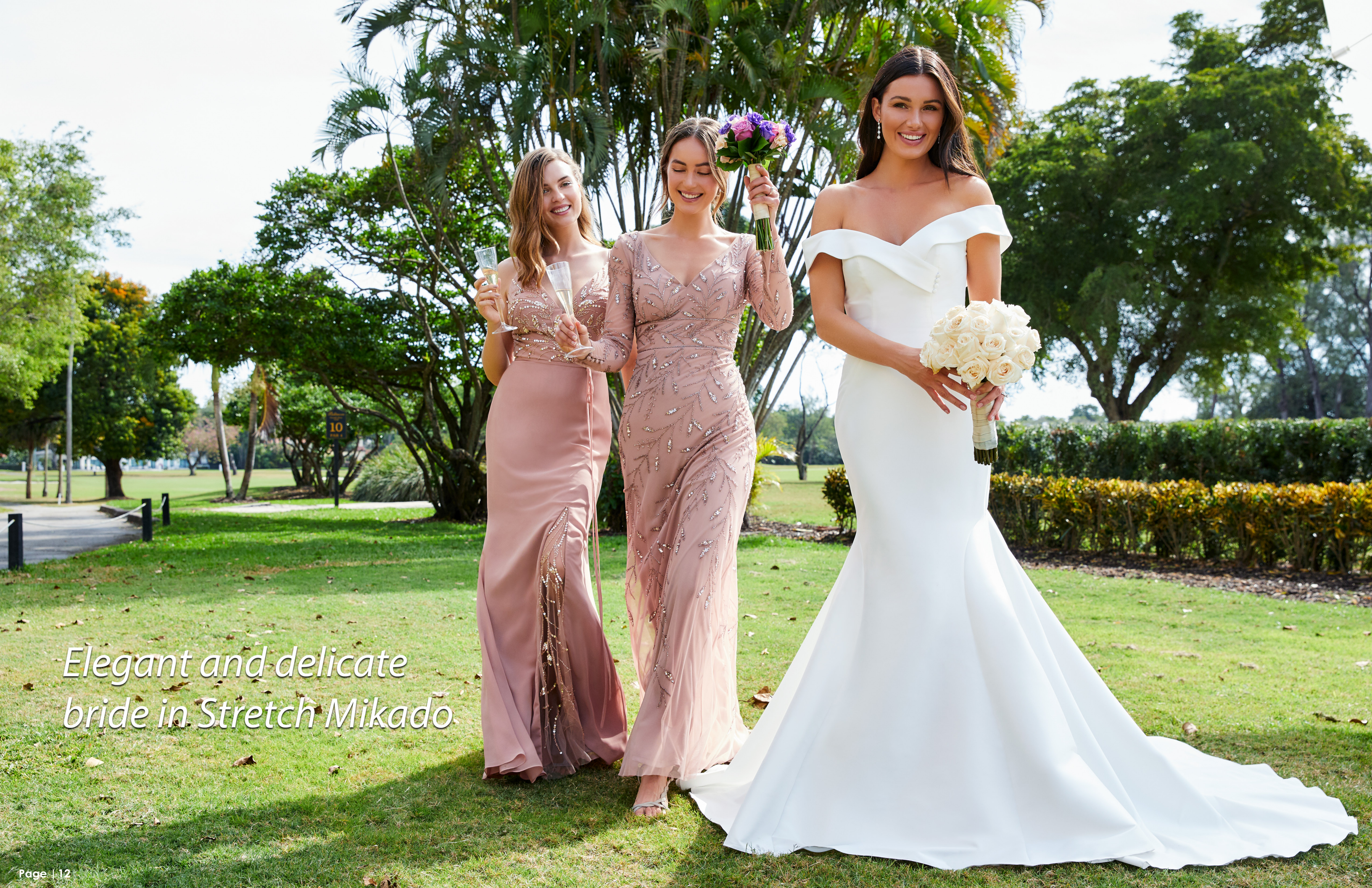
Elegant and delicate bride in Stretch Mikado