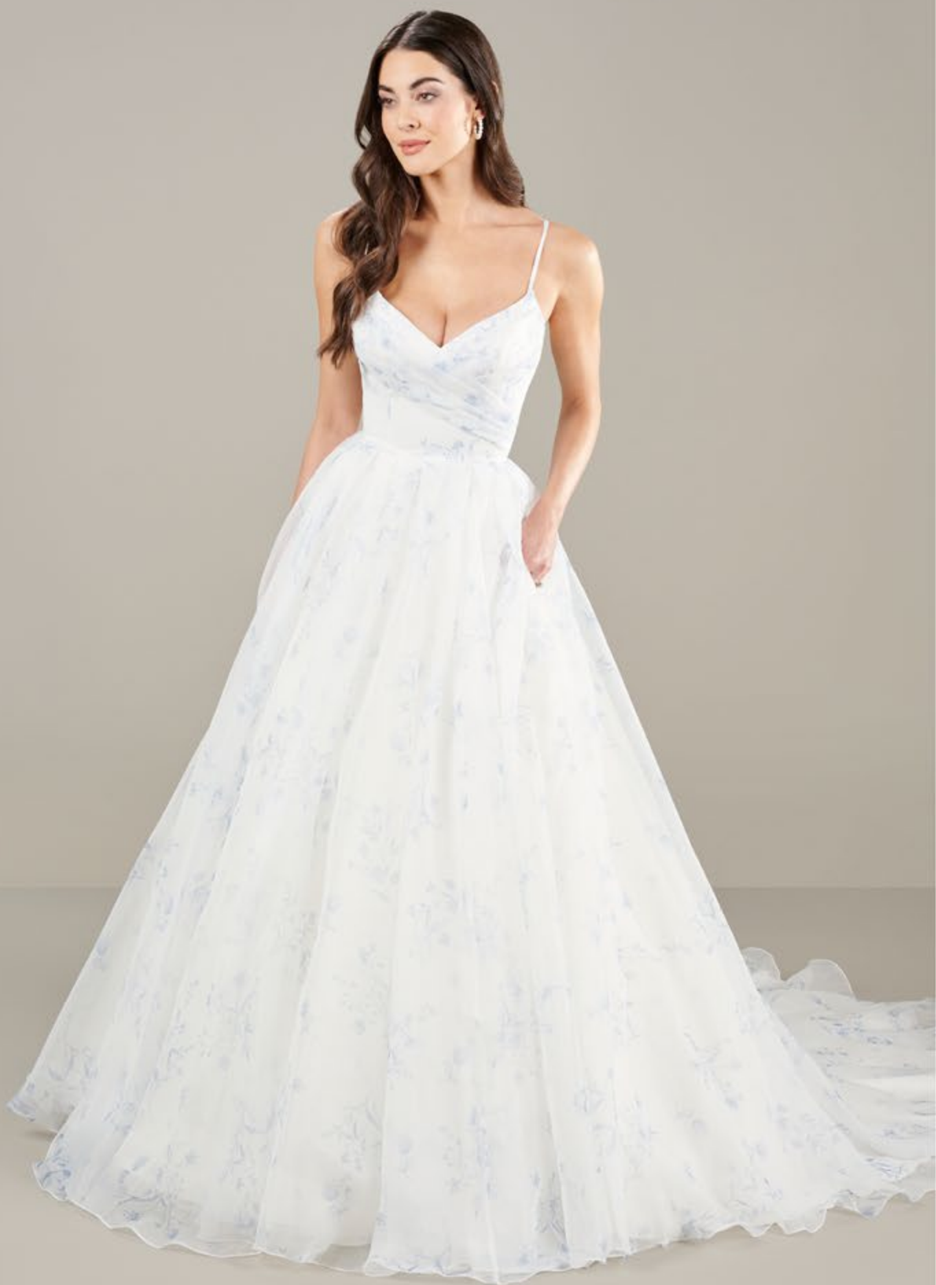
31271 IVORY, IVORY MULTI, IVORY/BLUE