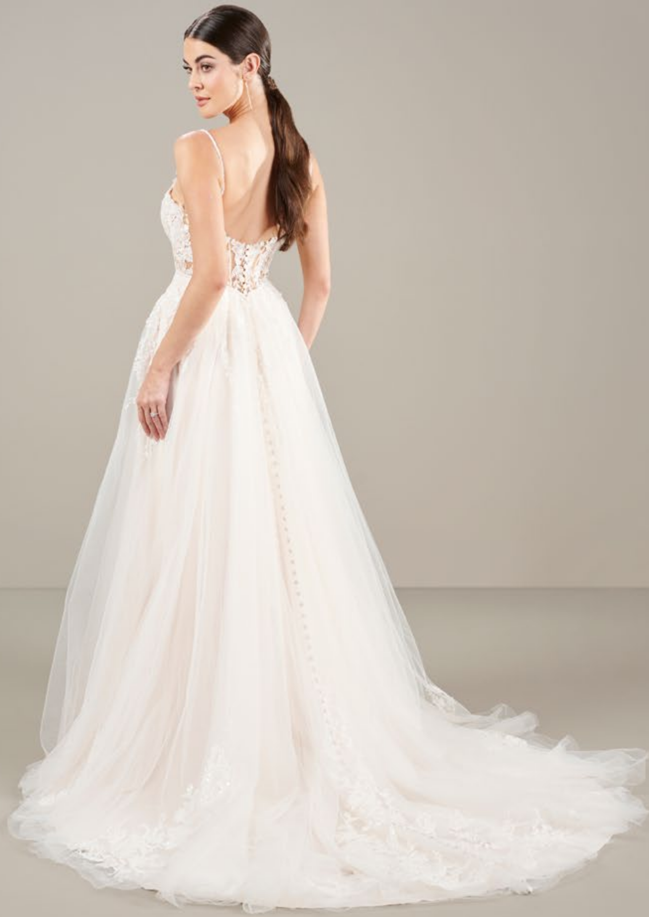
31279 IVORY/ALMOND, IVORY/IVORY